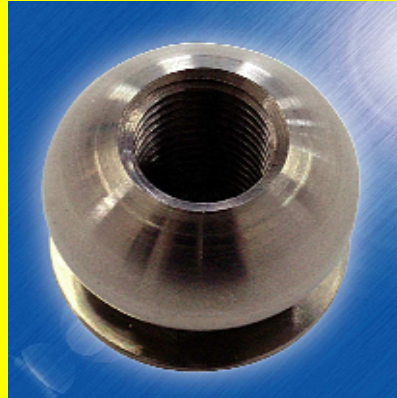
Part # R830-CY